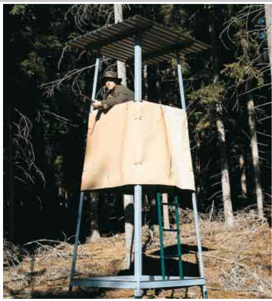
The raising hide shown above has a roof of corrugated sheet and cladding of felt.