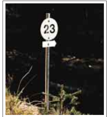
Beat marking for safer hunt.